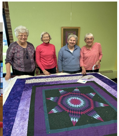
NUMC quilters with their beautiful work!