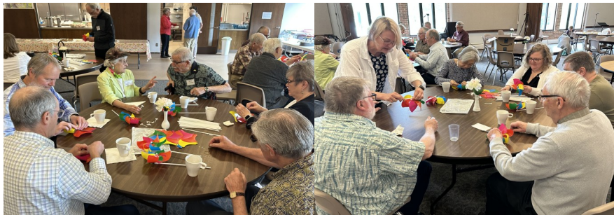
Sunday morning coffee provided lot's of volunteers to assemble pin wheels for Pride in the Park.