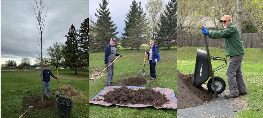
Tree planting at NUMC. 7 additional trees were planted to replace the many that have been lost over the past few years.