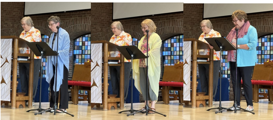
United Women in Faith Sunday.