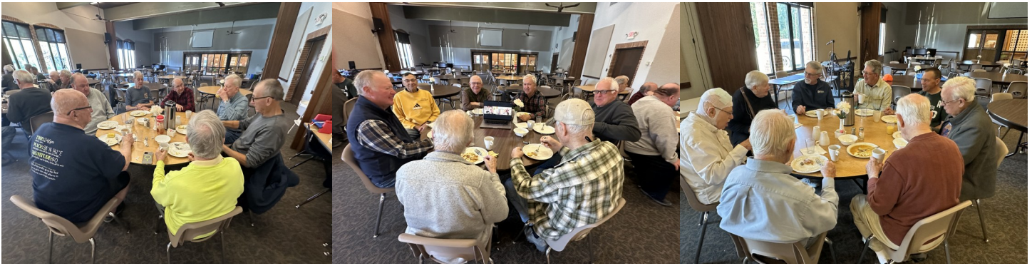
Friday morning Men's Breakfast group.