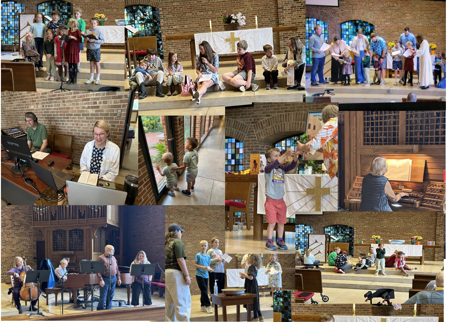
Scenes from Sunday worship services at NUMC!