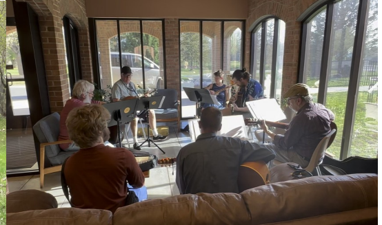
ArtMakers providing music on a Super Wednesday.