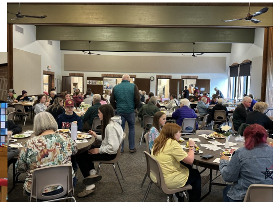
Final Super Wednesday meal for the program year. See you in September!