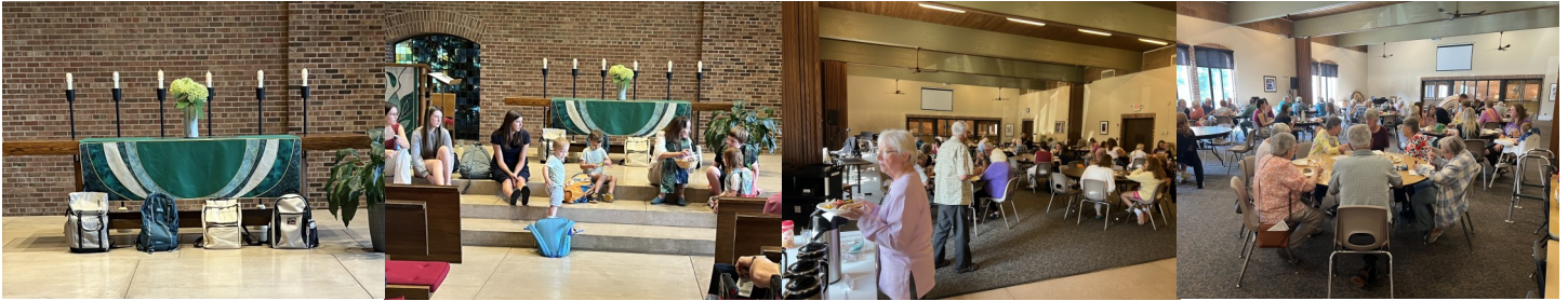
A few photos from Celebration Sunday and the Blessing of the Backpacks. Children were encouraged to bring their backpacks to worship where they each received a backpack tag during the blessing. A brat feed fundraiser by the NUMC softball team followed the worship service.