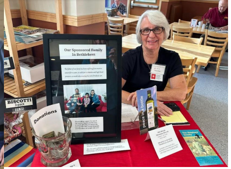
On October 6 and 13 MICAH hosted an opportunity for the congregation to light a candle and say a prayer in remembrance and lament for the suffering the past year in the Holy Land.