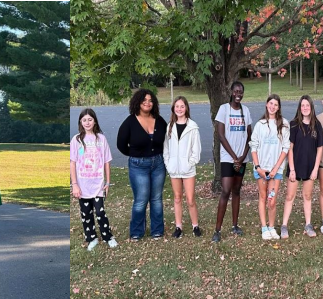
Thanks to all who came out to help at the Fall Facilities work day on September 28th.