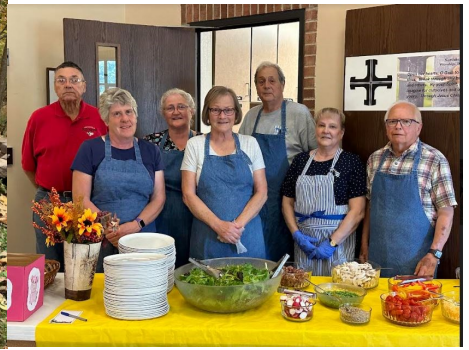
A few of our wonderful Super Wednesday kitchen crew!