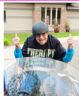
Mom on her motorcycle ride at 93 yrs old.