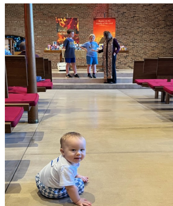
"I can hear the Children's Message just fine from back here."