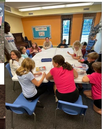
KC3 kids with Youth Group leaders.