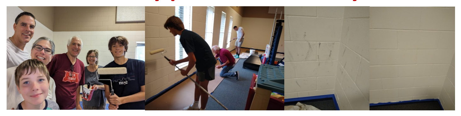
SALT Youth led us in service to prepare for the upcoming school year's programs by painting the lower half of the gym. Thanks to all who helped!