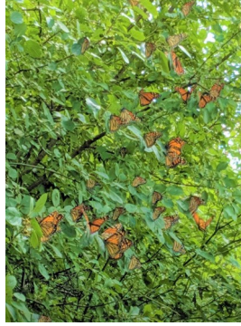
Monarchs gathering in a tree at Carleton Arb for migration south.

The monarch butterfly migration across the continent provides an invaluable service. It is thanks to these pollinators, such as butterflies, bees, and other insects, that we have many of the flowers and foods that we enjoy. Taking cues from the environment, the monarchs know when it is time to travel south for the winter. Some fly as far as 3,000 miles to reach their winter home! The monarch migration is an amazing process. Monarchs typically live from 2 to 6 weeks except for the last generation of the year, which can live up to 8 to 9 months. It is the fourth or fifth generation of monarchs each year which actually migrate to Mexico in late August or September. The ones that migrate live longer, from August or September to about April (although a lot also die before this).