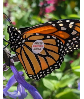
A tagged monarch

The Monarchs have lost a lot of habitat and their numbers are declining. The best thing we can do is stop