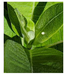
Monarch egg on milkweed plant.

It's estimated that 90% of monarch eggs that are laid do not survive to adulthood. This is due to environmental factors such as drought, loss of habitat, pesticide use and natural predators. The most critical reason for their decline is the lack of milkweed available for them to keep reproducing. Milkweeds are the required host plants for monarch butterfly caterpillars (female monarchs only lay their eggs on milkweeds, no place else) and their flowers provide nectar for bees, butterflies, and other beneficial insects.