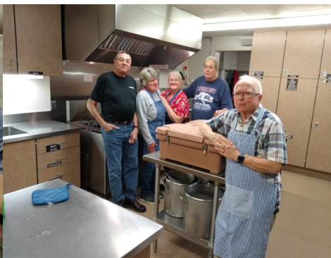
The "kitchen elves" prepare our wonderful Super Wednesday meals.