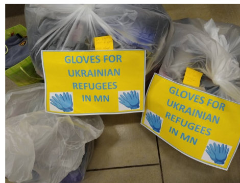
SALT collected 135 pairs of gloves for Ukrainian refugees resettled in MN.