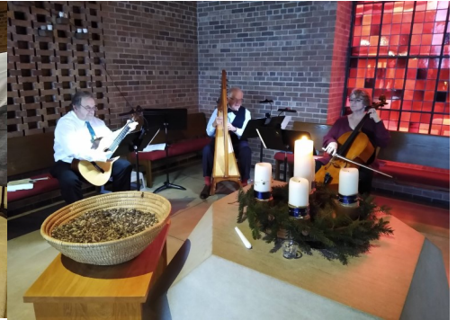
The Advent service for peace and healing offered a contemplative space for those who needed it this season.