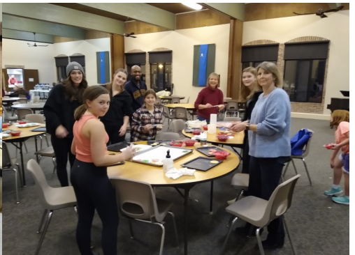
Christmas cookie decorating led by our SALT youth. Dozens of cookies were delivered to our friends at the Laura Baker Services Association.