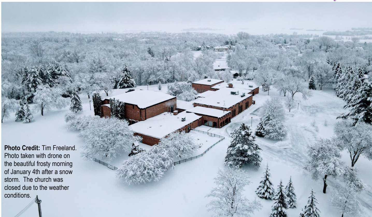
Photo taken with drone on the beautiful frosty morning of January 4th after a snow storm. The church was closed due to the weather conditions.