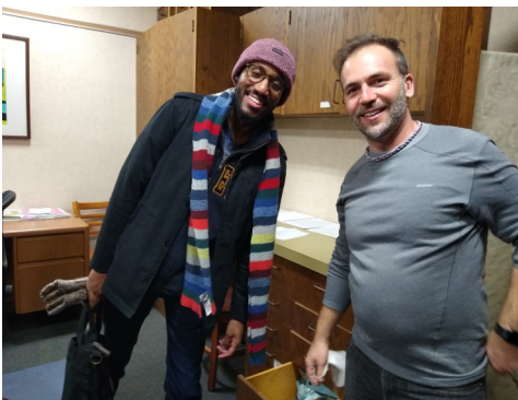
Two little elves getting ready to deliver the Christmas cookies.