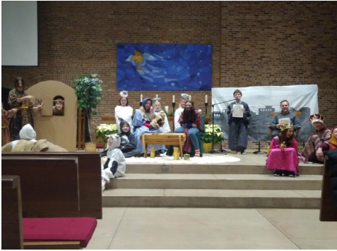
Thanks to all the kids and volunteers who made the Christmas pageant happen so our youngest disciples could tell us the ancient story.