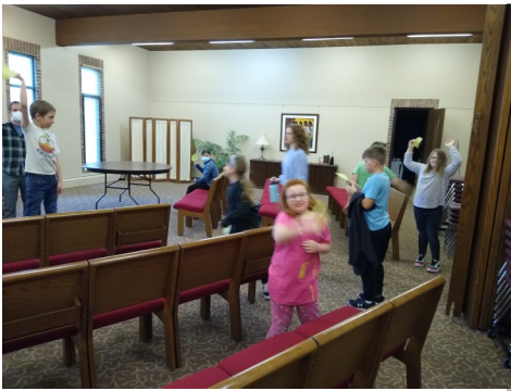
KC3 kids celebrate and learn about Palm Sunday.