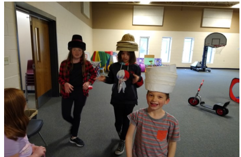
KC3 (Kids Creating Community through Christ) fun on Wednesdays from 3:30-5:30 pm!