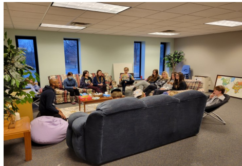
The NUMC Youth meet each Wednesday evening 6:30-8:00 pm.