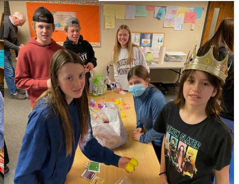
NUMC youth met to pack eggs for the egg hunt, and to share in fun and fellowship the Wednesday before Holy Week.