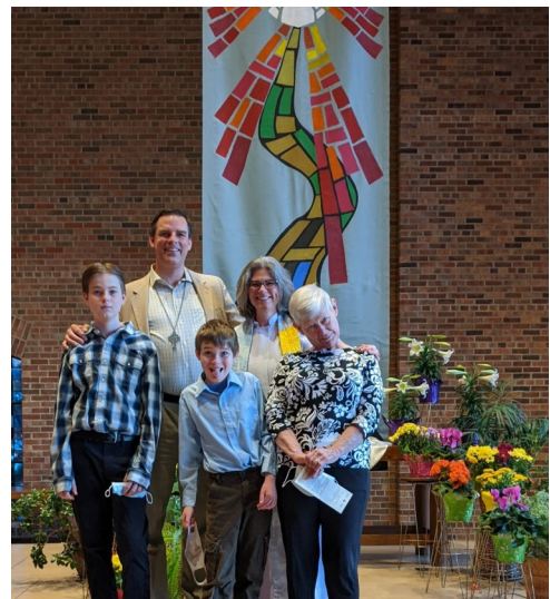
Happy Easter and new life from ours to yours!