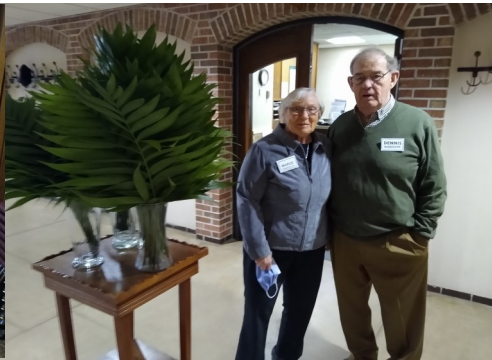
Hosanna in the highest! We celebrated Jesus triumphant travel into Jerusalem on Palm Sunday!